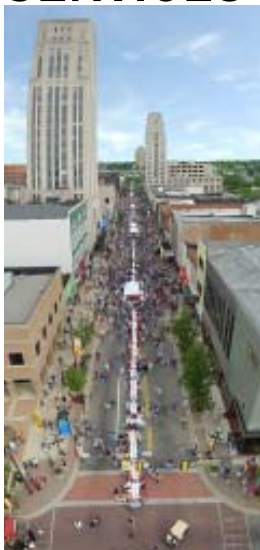
The annual Cereal Festival is unique to Battle Creek