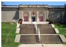
Kingman Museum in Leila Arboretum