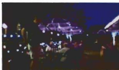
Buddy Pops on the Patio by the River